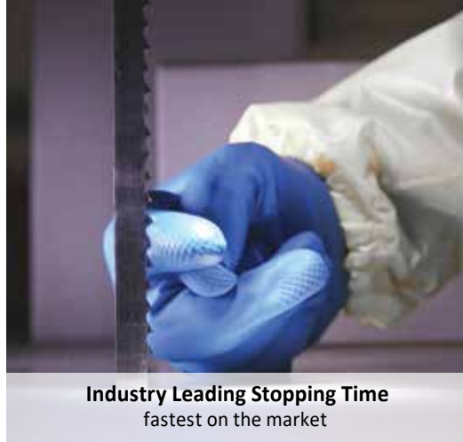
Industry Leading Stopping Time fastest on the market