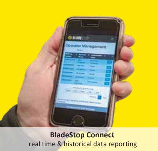
BladeStop Connect real time & historical data reporting