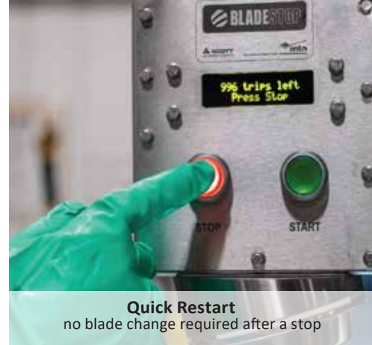
Quick Restart no blade change required after a stop

The BladeStop's unique sensing and fast-stopping capabilities are the difference between having a near miss or an amputation. “BladeStop just paid for itself” -KILCOY General Manager