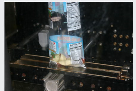
Continuous Motion Reciprocating Jaws for the Strongest Seals